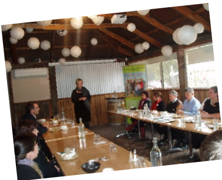
Albury Local Court Registrar addressing the crowd at the Law Week breakfast

We have had a number of great projects this year which included two workshop on Wills, one for Aboriginal people and one for parents and carers of persons with impaired capacity. These were made possible with the assistance of Ashurst Lawyers from Sydney. The Deniliquin Coordinated Outreach clinic is also a CLSD project which provides weekly advice and minor assistance at the Hub.