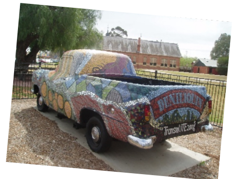
Deniliquin Outreach – famous Mosaic ute

Since its inception in March this year, we have noticed an increase in the number of people using our service. This is also a result of the active participation of Intereach, in particular, the new Hub Coordinator there, who have are constantly referring clients to all the visiting services. As a result we are to commence travelling to Deniliquin the night before, to allow us to have more appointments available; from 9am instead of starting at 10.30am.